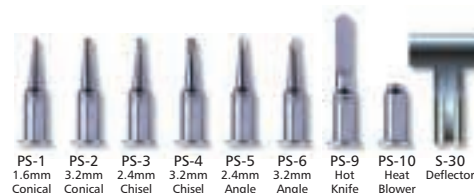
PS-1 1.6mm Conical PS-2 3.2mm Conical PS-3 2.4mm Chisel PS-4 3.2mm Chisel PS-5 2.4mm Angle PS-6 3.2mm Angle PS-9 Hot Knife PS-10 Heat Blower S-30 Deflector